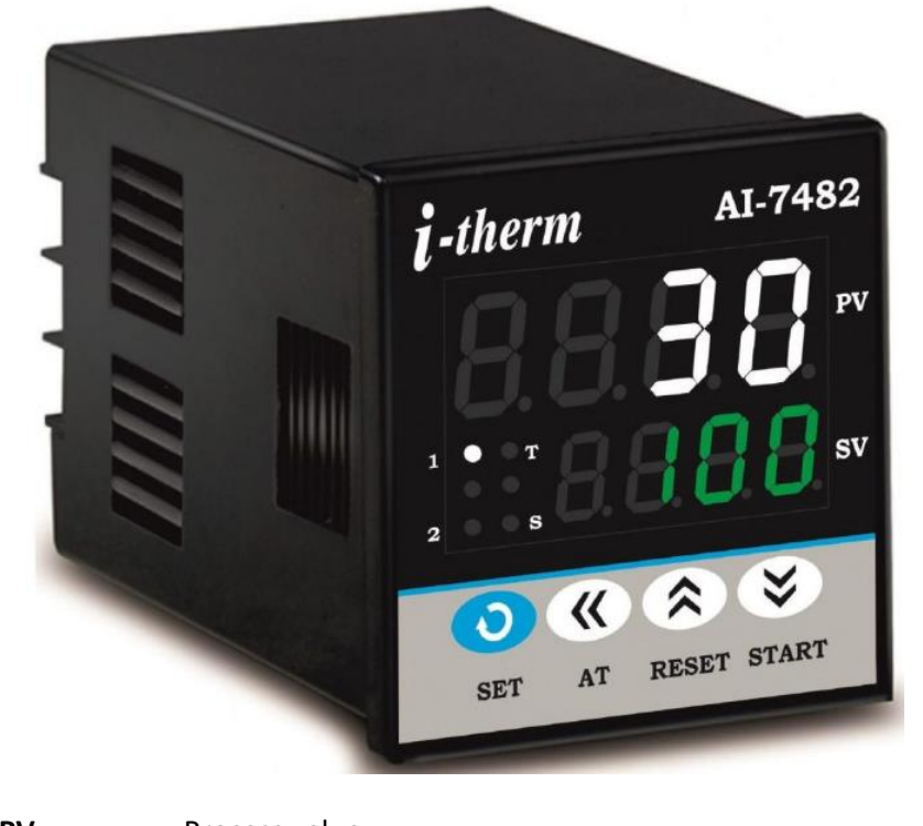
PV : Process value